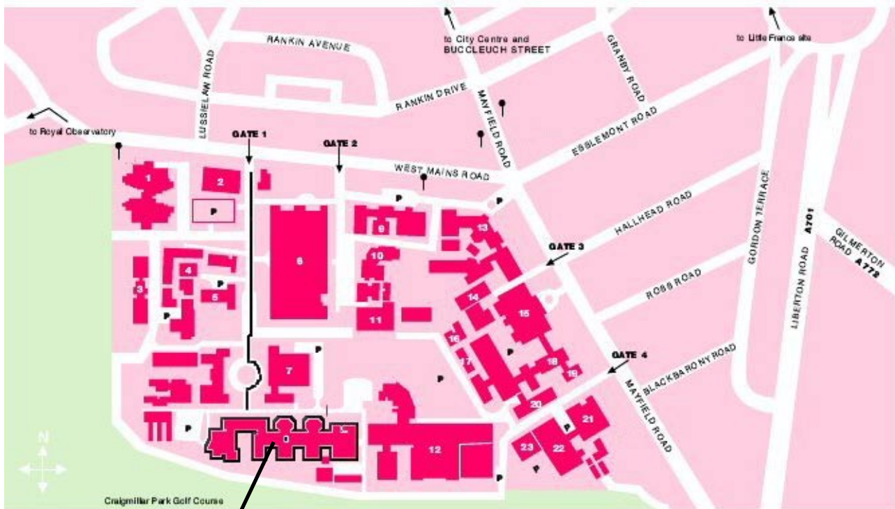
SAC Edinburgh: Peter Wilson Building